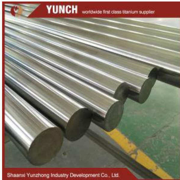
• Tantalum Bar Factory Price Wholesale