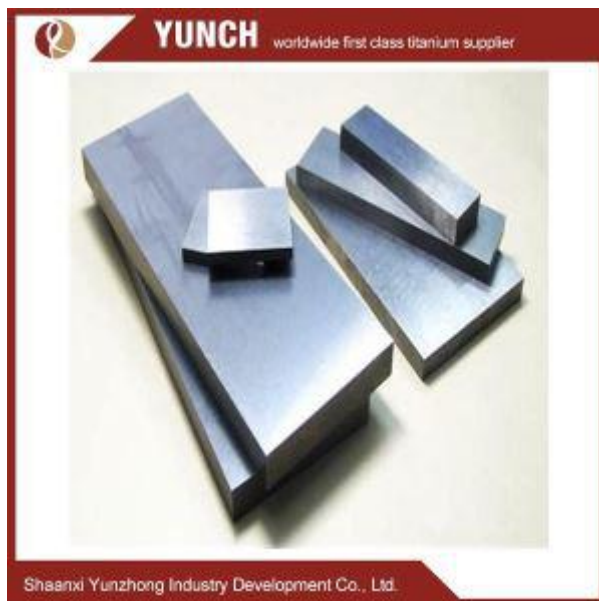
• ASTM B551 Zirconium702 Target