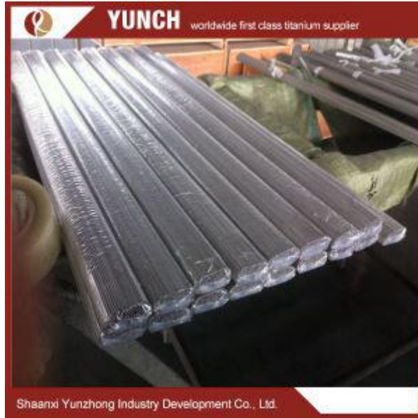
• Titanium Tig Welding Wire dia 1.6mm long 1000mm sticks