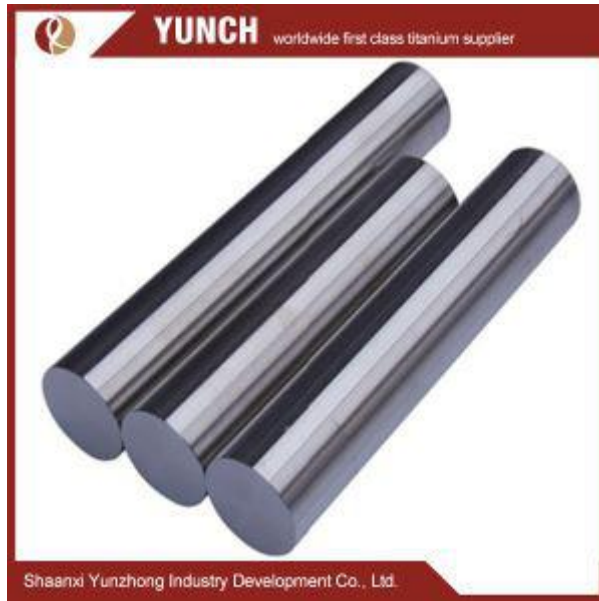
• Zirconium Round Rod For Sale